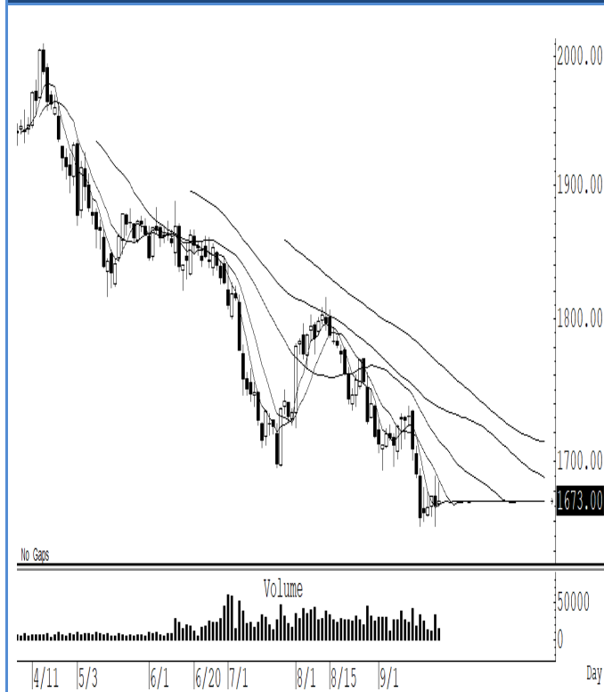
GOU22 (Close 1,673.0 Chg 2.40)

ราคาทองคำโลกแกว่งออกด้านข้าง หลังทำจุดต่ำใหม่ ตรงนี้มีโอกาสตีกลับได้บ้าง แต่เป็นการตีกลับในแนวโน้มขาลง สั้น ๆ ตีกลับไม่ข้ามแถว ๆ 1,700 ดอลลาร์ ดูเสี่ยงอาจมีจุดต่ำใหม่ แนะนำ trading ในกรอบระหว่าง 1,700-1,640 ดอลลาร์ ระวังกำไร หรือในกรณีที่ปิดต่ำกว่าระดับ 1,640 ดอลลาร์ แนะนำ ถือ short หวังผลปรับตัวลงไปแถว ๆ 1,520 ดอลลาร์ ระวังกำไร